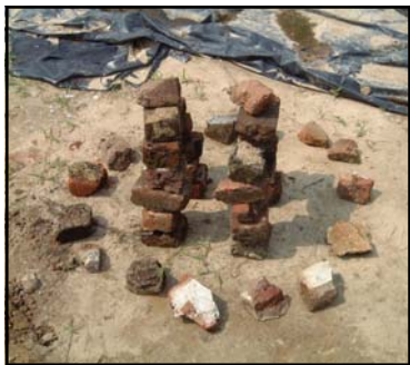
NIAHD students created a brick 'temple' at Fairfield to temporarily protect a feature.