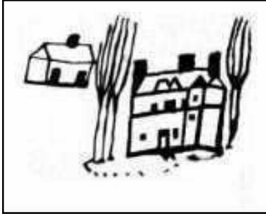
1847 Sketch of Fairfield

P.O. Box 157 White Marsh VA 23183 Phone: 804-694-4775 Email: fairfield@ccsinc.com