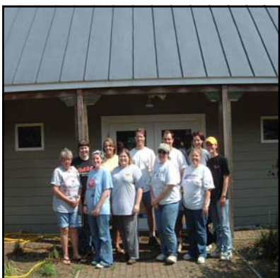
Students from LCCC pose in front of the Rosewell Lab.