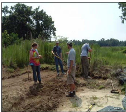
NIAHD students backfill (above) and screen artifacts (below).